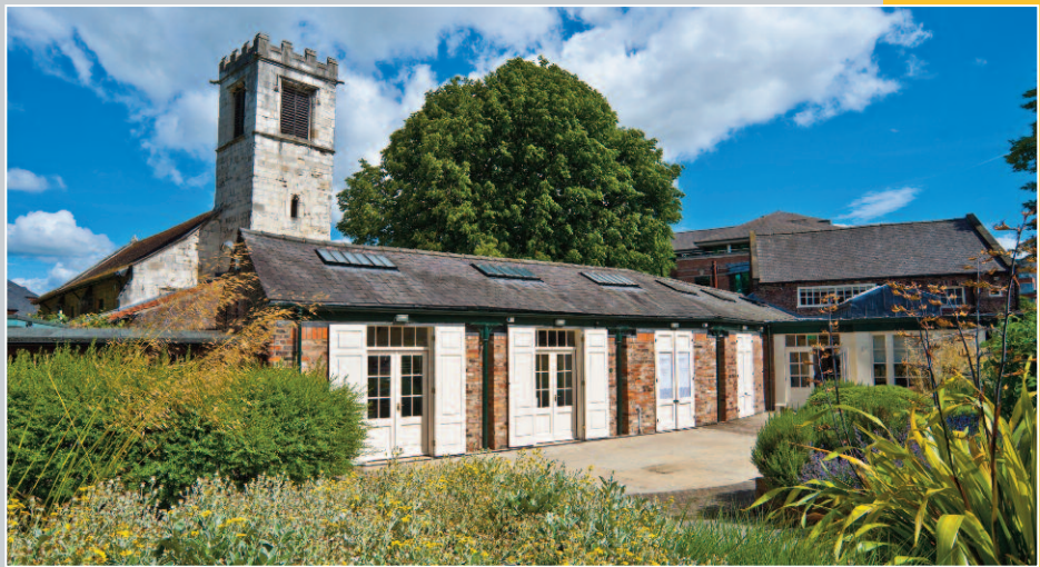
STUDIOS 1 & 2 ST ANTHONY'S HALL