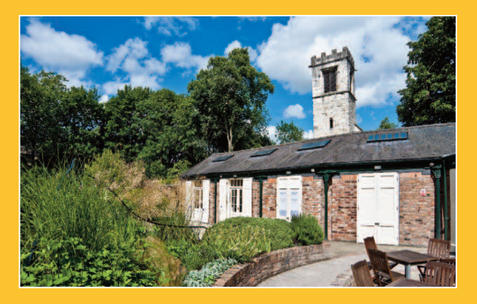
STUDIOS 1 & 2 ST ANTHONY'S HALL, YORK