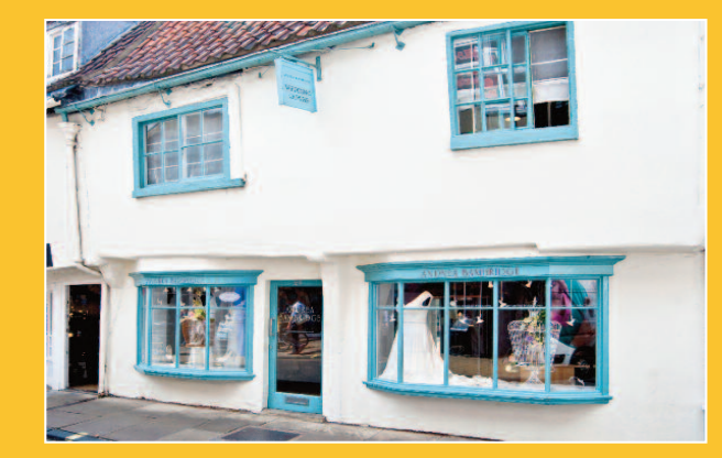
64 Goodramgate, York